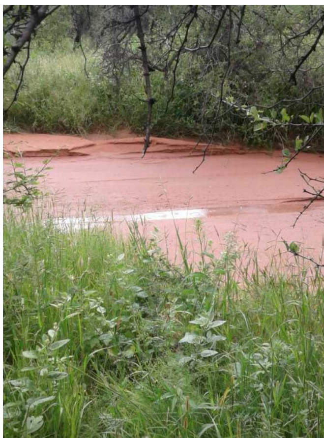
Figure 2: Typical riverine habitat brown hyaena resting site.

*Reproductive status of females only, confirmed by camera trap data of the female suckling cubs at a den site.